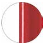
RAL 3003 VR Ruby red