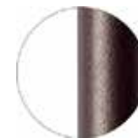
VR Rough metallic bronze