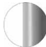
RAL 7037 VR Matt Dusty grey