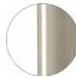
PANTONE 402 C VR Turtle-dove