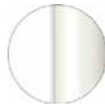
RAL 9010 VR Pure white