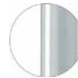
RAL 9006 VR White aluminium