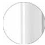
RAL 9016 VR Traffic white