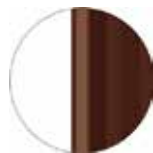
RAL 8017 VR Chocolate brown