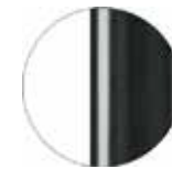
RAL 7016 VR Anthracite grey