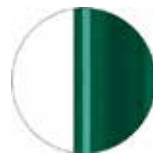
RAL 6005 VR Moss green