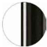
RAL 9005 VR Jet black