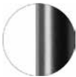
RAL 9005 VR Matt Jet Black