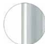
RAL 9006 VR White aluminium