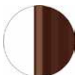
RAL 8017 VR Chocolate brown