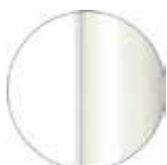
RAL 9010 VR Pure white