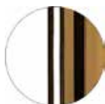
CR X Brass chrome