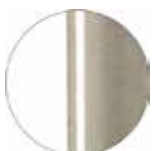
PANTONE 402 C VR Turtle-dove