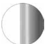
RAL 7037 VR Matt Dusty grey