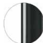
RAL 7016 VR Anthracite grey