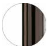
CR X Burnished chrome