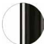
RAL 9005 VR Jet black