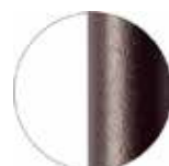
VR Rough metallic bronze