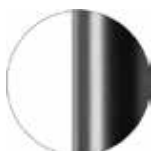
RAL 9005 VR Matt Jet Black