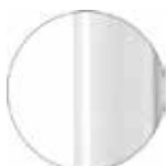
RAL 9016 VR Traffic white