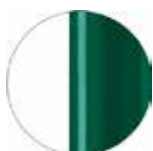
RAL 6005 VR Moss green