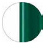
RAL 6005 VR Moss green