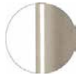
PANTONE 402 C VR Turtle-dove