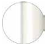
RAL 9010 VR Pure white