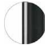
RAL 7016 VR Anthracite grey