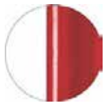
RAL 3003 VR Ruby red