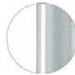
RAL 9006 VR White aluminium