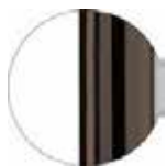
CR X Burnished chrome