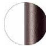
VR Rough metallic bronze