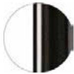
RAL 9005 VR Jet black