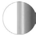
RAL 7037 VR Matt Dusty grey