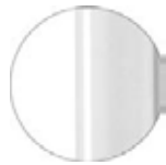
RAL 9016 VR Traffic white