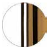
CR X Brass chrome