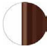
RAL 8017 VR Chocolate brown