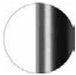
RAL 9005 VR Matt Jet Black